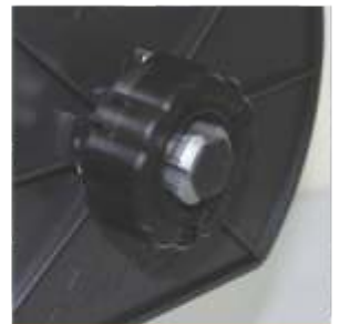
Easy assembly lock module for quickly and firmly label roll holding