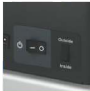
Rewinding direction switch to rewind "inside or outside" label rolls