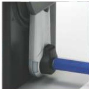
Colored LED indicator provides rewriter operation status